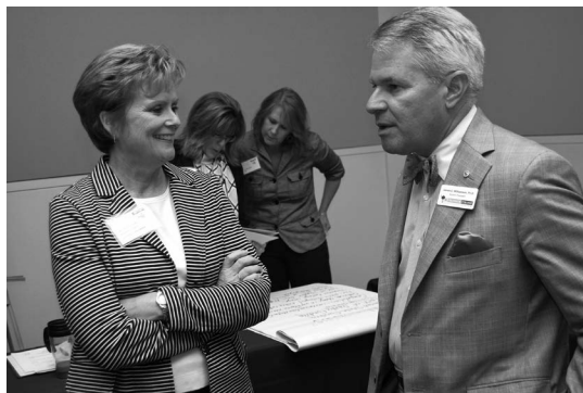
The CCTC 2014 Strategic Planning Session included the College's leadership, faculty, staff, and community leaders.