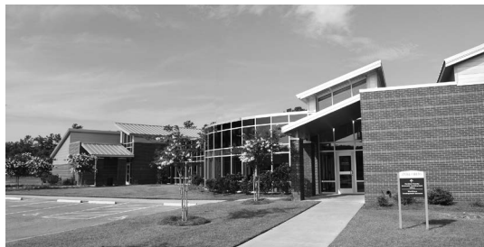
The Health Sciences Center opened in 2010; Kershaw County Campus is the next location scheduled for expansion.