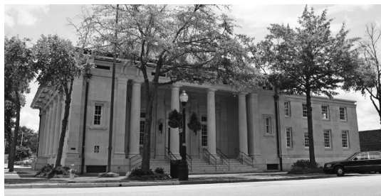
CCTC's Advanced Manufacturing Technology Training Center is scheduled to open in Fall 2015; CCTC's Legal Studies Center opened in Fall 2013.